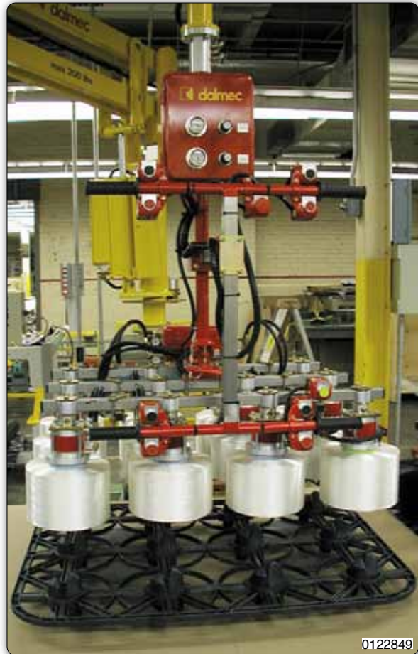
Manipulator equipped with an expanding mandrel for the simultaneous gripping of twelve reels of thread.