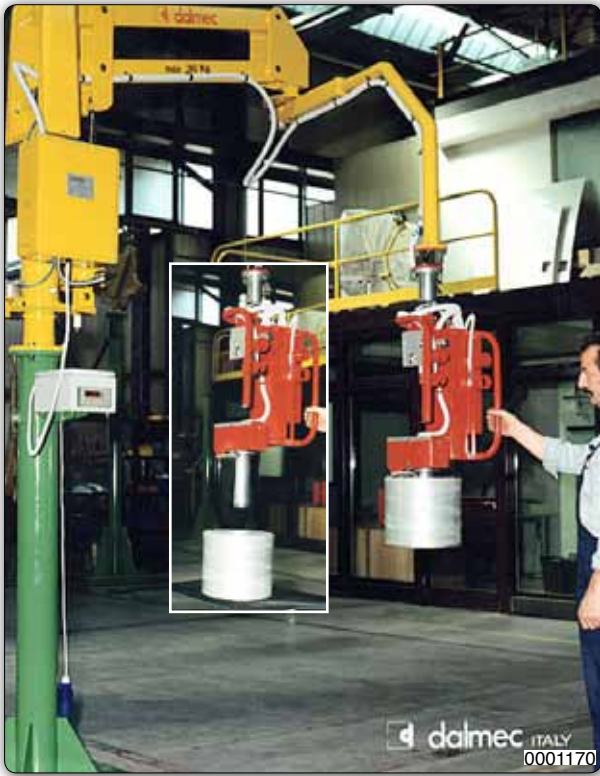
PMC type Partner manipulator, column mounted, equipped with an expanding mandrel for handling and 90° inclination of reels. The manipulator has a load cell for checking the weight of the reels.