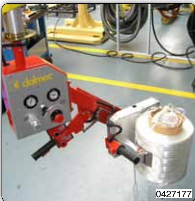
Pneumatic expansion mandrels or pinch jaws toolings for gripping, handling and inclination of reels having different dimensions and characteristics.