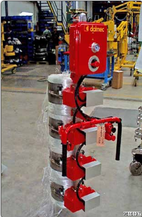
Manipulator equipped with four sets of pneumatic grippers for gripping fiberglass reels simultaneously.