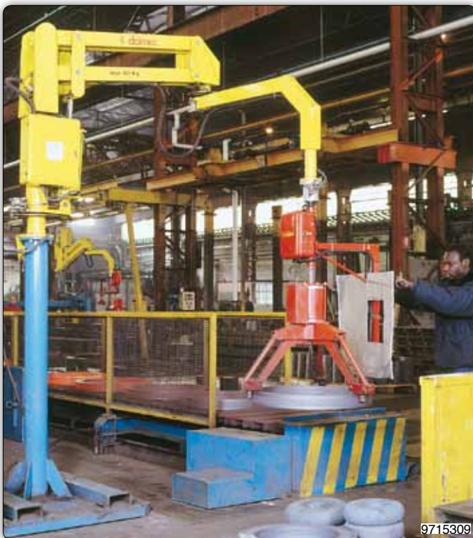
PMC type Partner manipulator, column design, with pneumatic gripper equipment, made to move mechanical parts from pallets to a vertical machine tool.