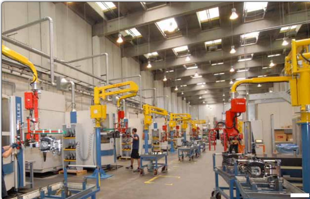
PMC type Partner manipulator, column design, equipped for loading and unloading of assembled leaf springs from a coating plant. The Manipulators have been given two types of picking equipment, which may be interchanged quickly: one uses a permanent magnet with electronic control and the other uses grippers.