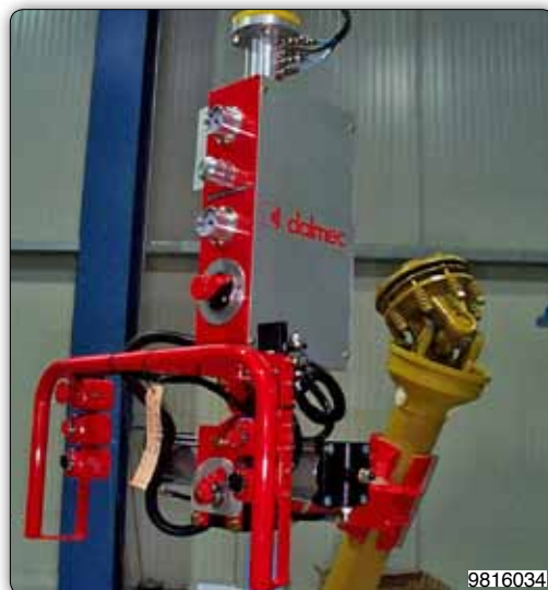
Manipulator with pneumatic gripper for taking and rotating transmission shafts.