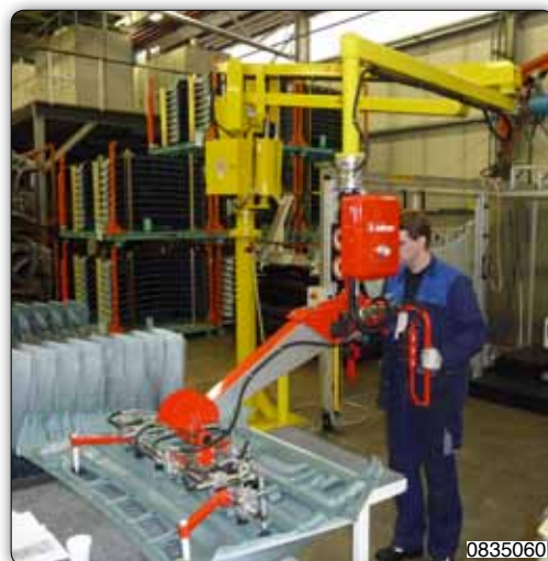
PMC type Partner manipulator, column mounted, used to handle crankcases.