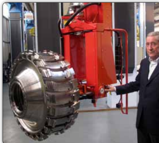
Manipulator with equipment for loading and unloading of aircraft turbines components, with pneumatic inclination.