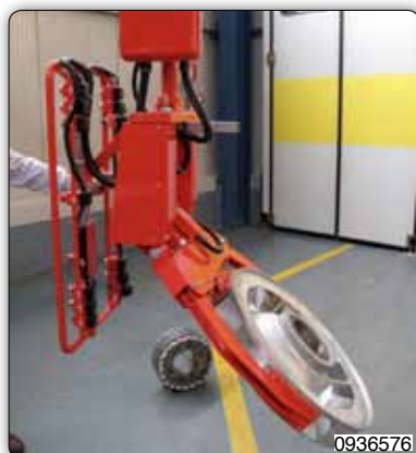
Tooling with pneumatic inclination of mechanical parts.