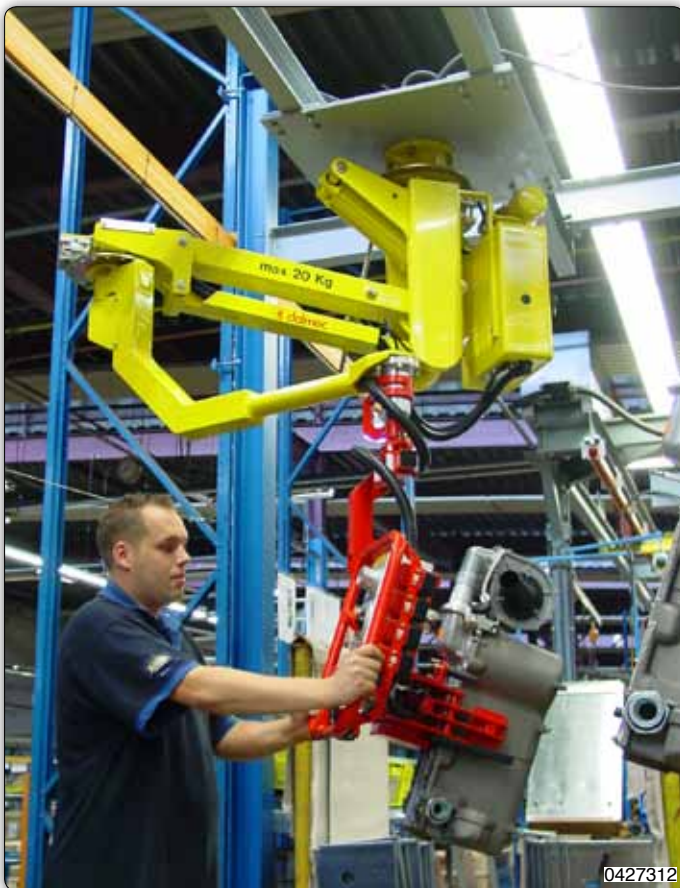
MIS type Micropartner Manipulator, overhead trolley mounted, used for the handling of parts of boilers.