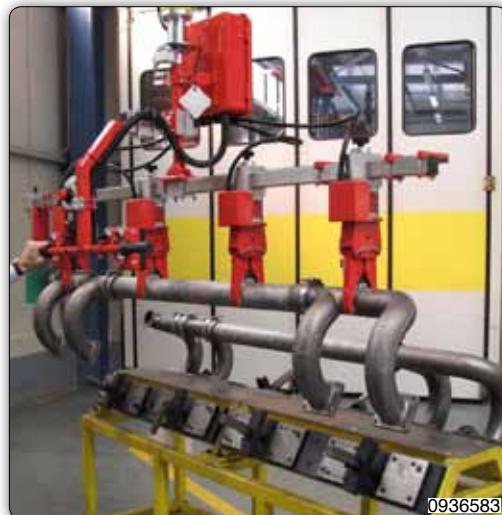
Manipulator equipped with a tooling made up of four adjustable gripping heads pneumatically operated for the gripping of exhaust manifolds.