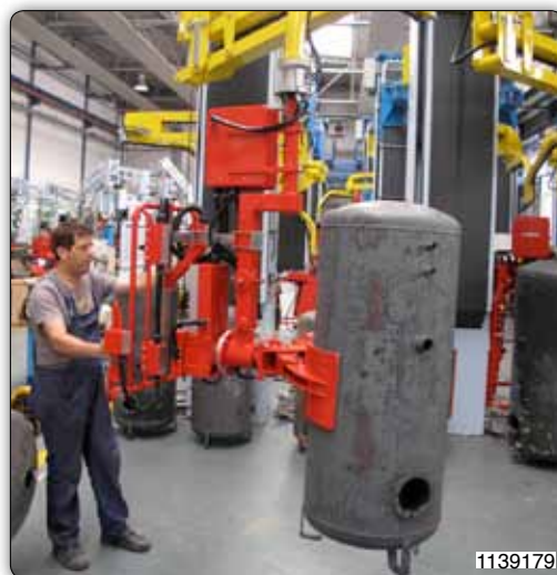
Manipulator with pneumatic gripping tool for picking and 90° pneumatic inclination of cylinders.