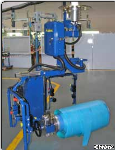
Manipulator with expanding mandrel for picking, inclination and manual rotation of reels.