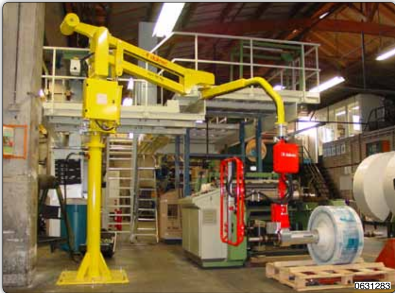
Manipulator complete with pneumatic gripper for picking and handling carrier shafts.