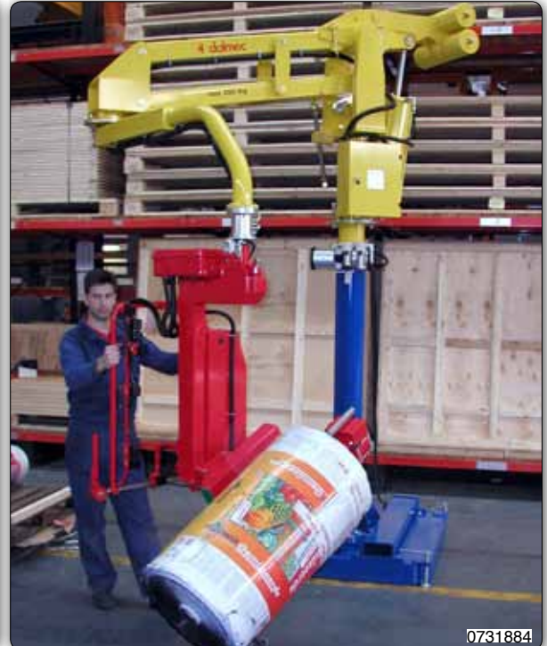
PMS type Partner manipulator, overhead trolley mounted unit, with pneumatic power drive, designed for lifting reels of plastic film from a cradle to a pallet. The tooling head consists of a pneumatically expanding mandrel with 90 degree pneumatic inclination.