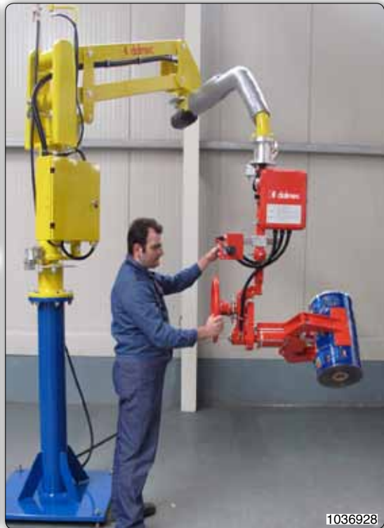
PMC type Partner manipulator, column mounted, with gripper tooling, for handling reels about their external diameter, with 360° manual rotation.