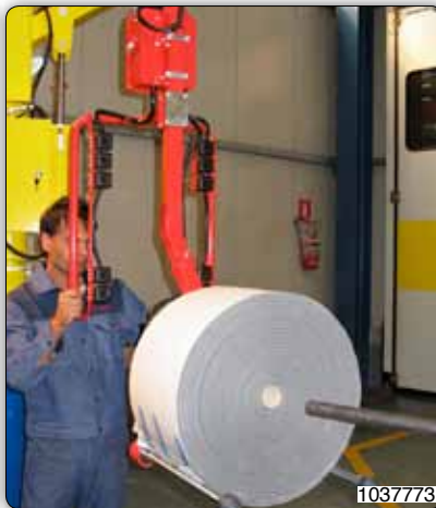
Manipulator with suction cups tooling for gripping and 90° manual inclination of little rolls. Vacuum is generated by a multi-stage "Venturi" type ejector.