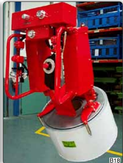
Manipulator with "Venturi" vacuum suction ring and 90° pneumatic inclination.