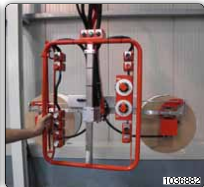
Mandrel gripping system of two reels with pneumatically adjustable center distance.