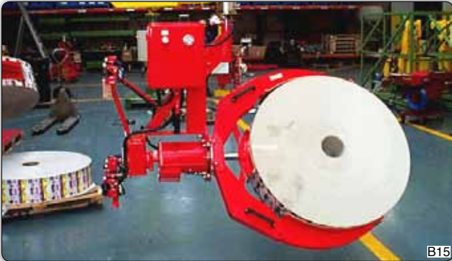
Manipulators fitted with gripper tooling for handling reels about their outside diameter, with pneumatic 360° rotation.