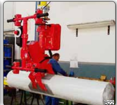
Expanding mandrel for the pneumatic rotation of reels.