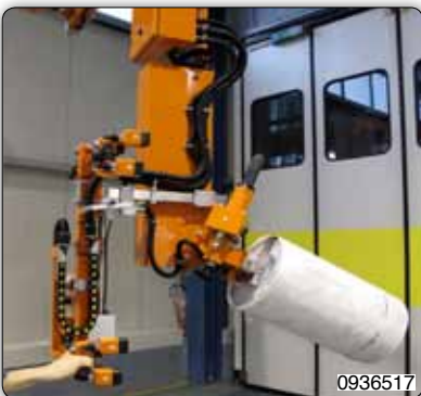
Gripping system with double mandrel with pneumatic inclination.