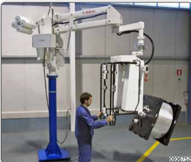
PMC column-type Partner, with pneumatic gripping jaws for handling rolls about their external diameter.