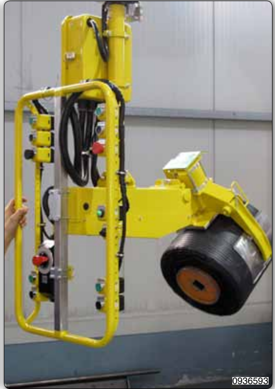
Manipulator fitted with expanding mandrel and anti-telescoping device. The tooling also incorporates 90° pneumatic inclination.