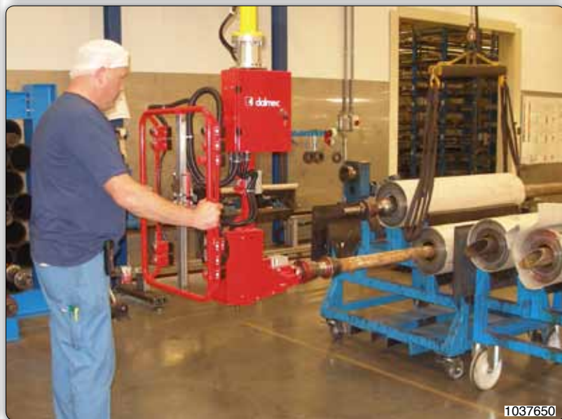
PMC type Partner manipulators, column mounted, complete with pneumatic gripper for picking and handling reel-carrier shafts.