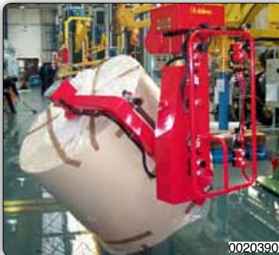
Gripping tooling with pin for handling and winding rolls.