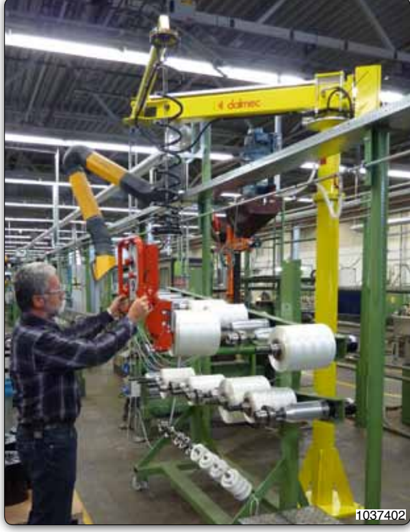
PFC type Posifil manipulator, column mounted unit, with expanding tooling for picking bobbins from a pallet and placing them horizontally to an unwinding machine.