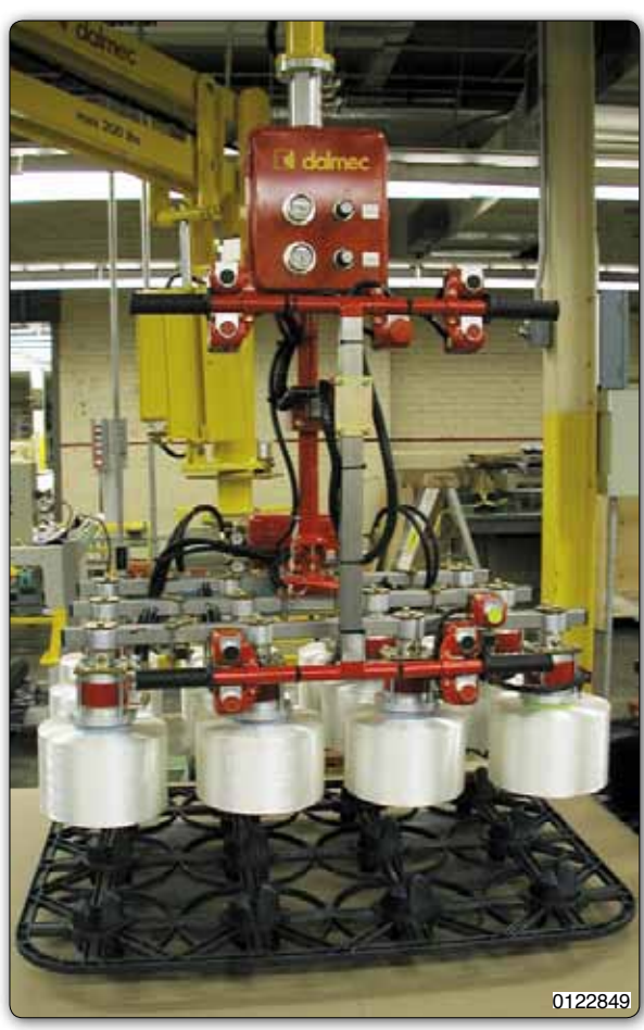
Manipulator equipped with an expanding mandrel for the simultaneous gripping of twelve reels of thread.