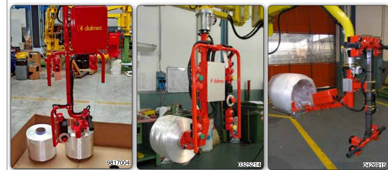
Pneumatic expansion mandrels or pinch jaws toolings for gripping, handling and inclination of reels having different dimensions and characteristics.