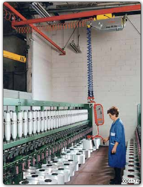
MPS Minipartner manipulator, overhead trolley mounted running in a bridge crane, fitted with pneumatic tooling head for the handling of reels.