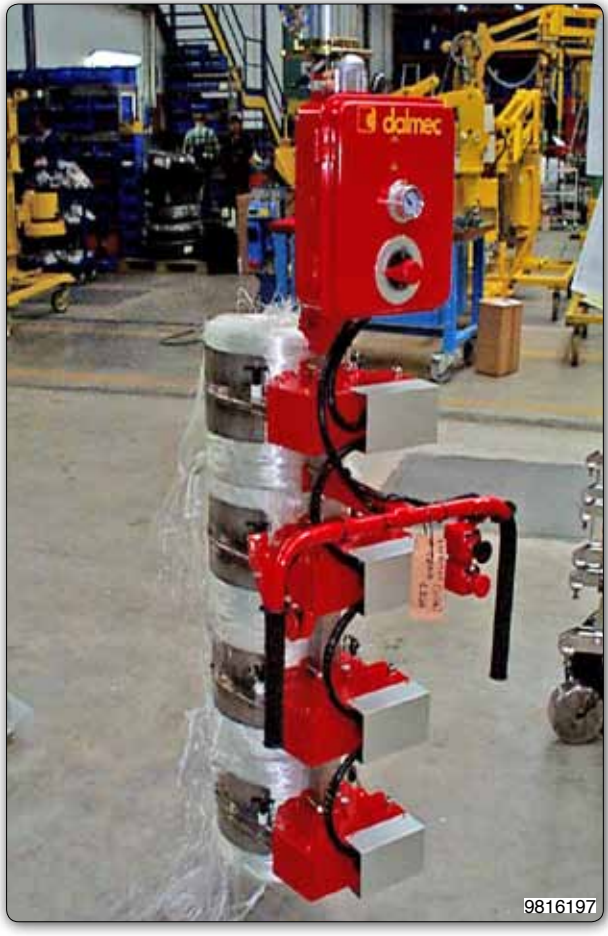
Manipulator equipped with four sets of pneumatic grippers for gripping fibreglass reels simultaneously.