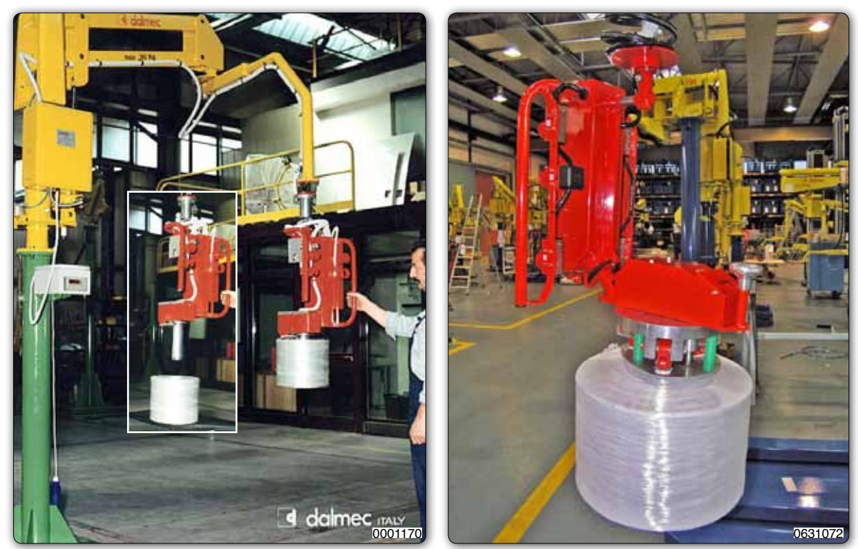
PMC type Partner manipulator, column mounted, equipped with an expanding mandrel for handling and 90° inclination of reels. The manipulator has a load cell for checking the weight of the reels.