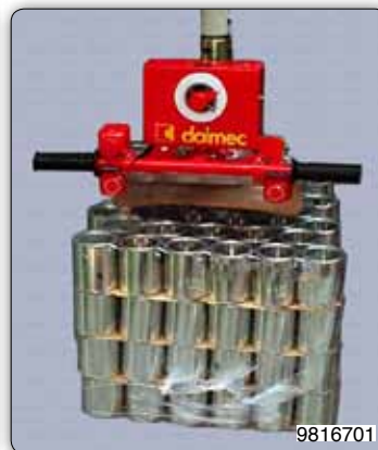
Gripping system for handling packs of food cans.