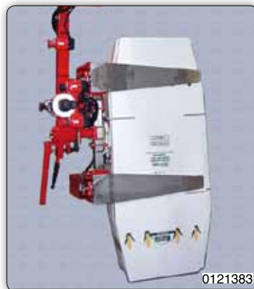
Gripping system for cartons packages.