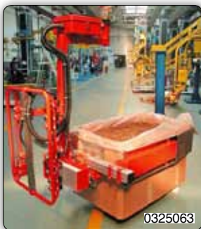
Gripping systems for gripping and handling of beverage containers with rotation/inclination of the load.