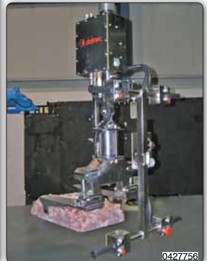
PMC type Partner Manipulator, column mounted, equipped with a stainless steel gripping system fit to handle ham moulds with loading/unloading of hangers.