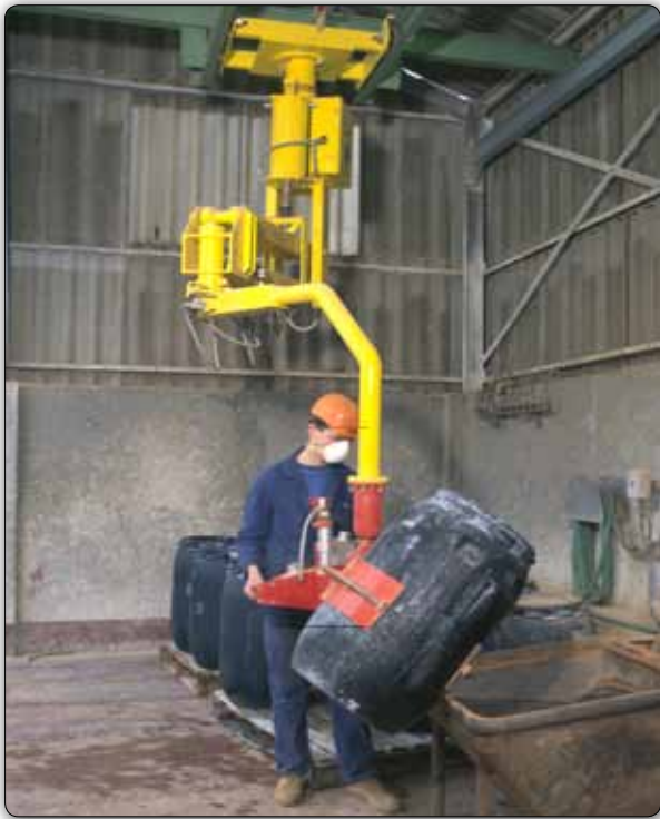
PMS type Partner manipulator, overhead trolley mounted version to cover several work stations, for handling and tipping drums.