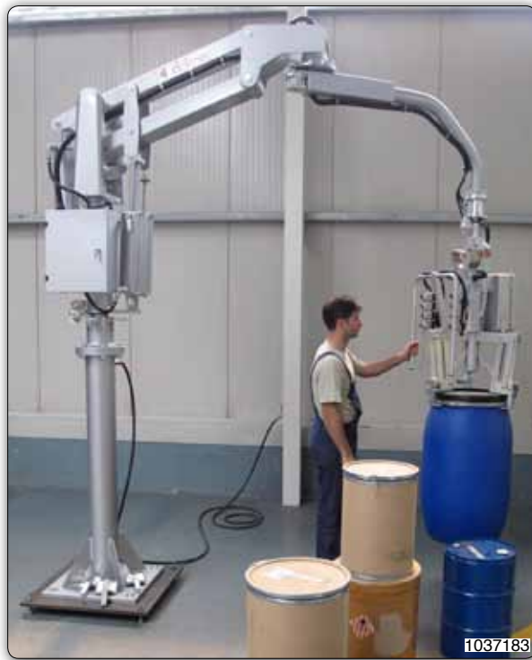
PMC type Partner manipulator, column design, equipped for picking and moving drums of varying shape and weight. Interchangeable grippers are available for handling different sizes of drums.