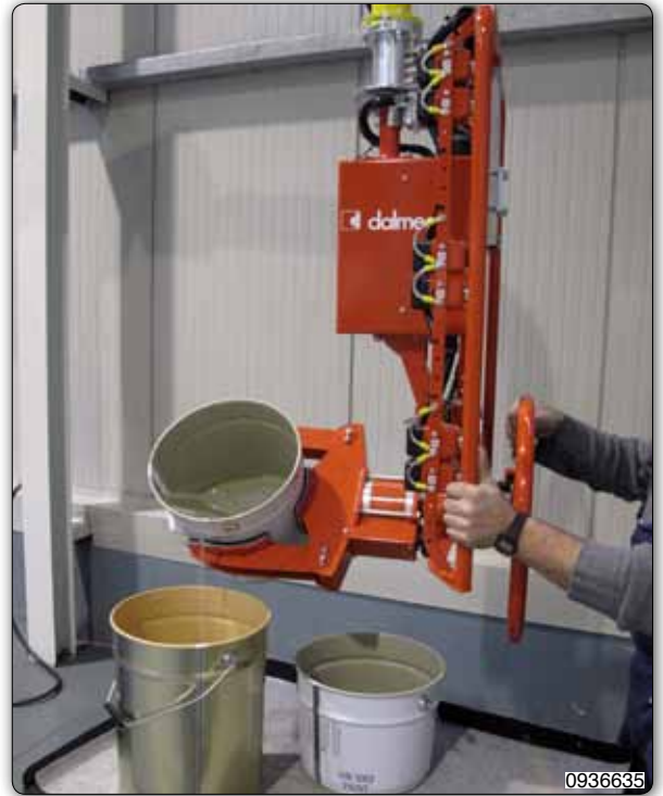
PMC type Partner manipulator, column mounted version, designed for picking and emptying drums.