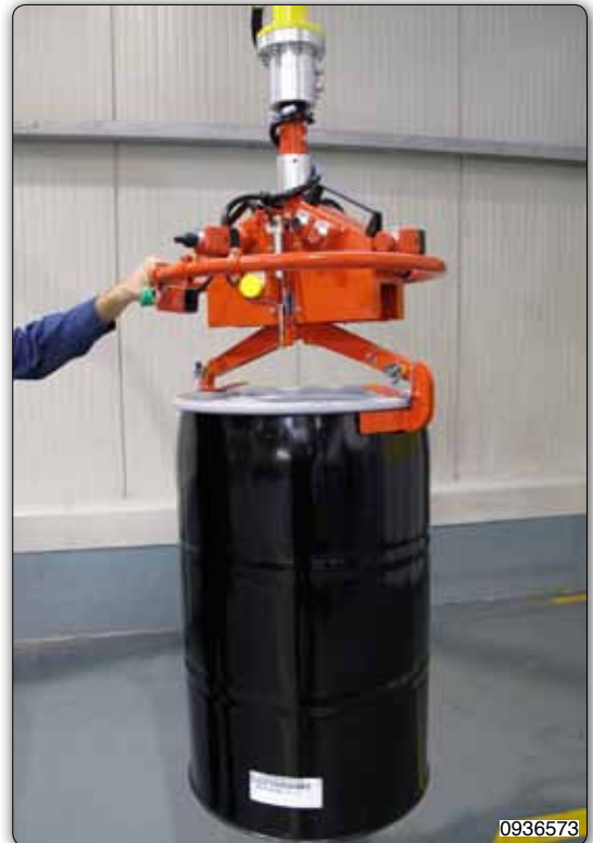
PMF type Partner manipulator, fixed overhead, made for picking and emptying drums, weighing up to 400 Kg.