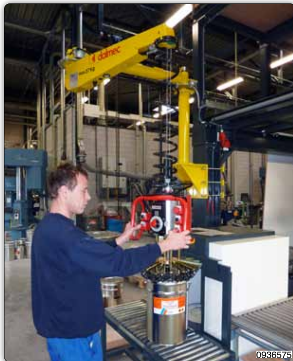
PVC type Posivel manipulator, equipped with pneumatic tooling for closing and gripping pails on the upper edge.