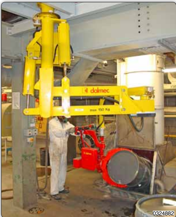
PMF type Partner manipulator, fixed overhead version, designed for the picking and emptying of drums.