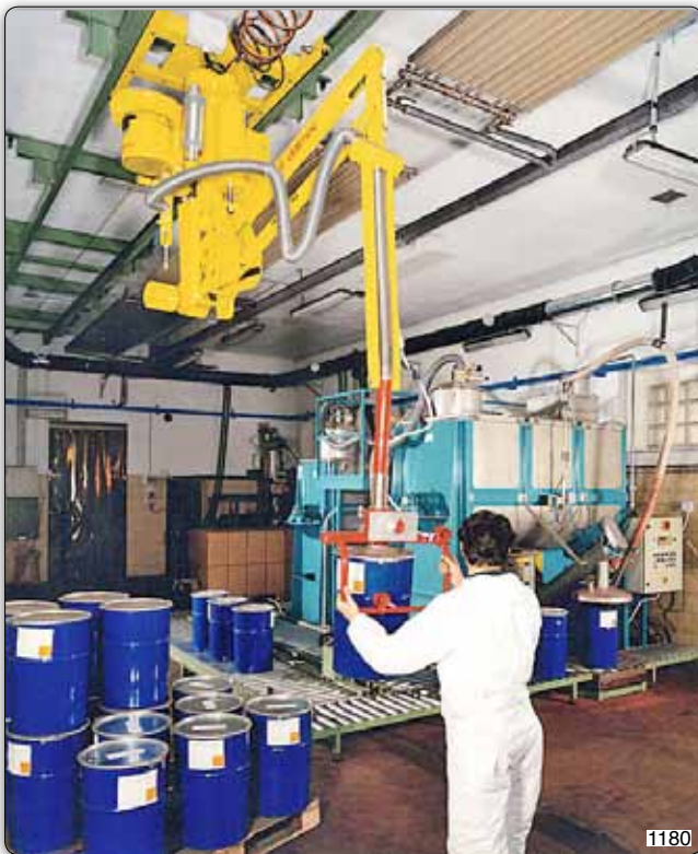
Some examples of devices for gripping and handling barrels and drums.