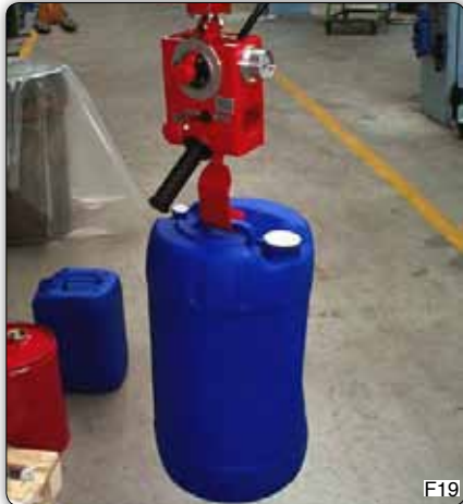
PVC type Posivel manipulator, column design, equipped with specially shaped hook designed for palletizing jerrycans.