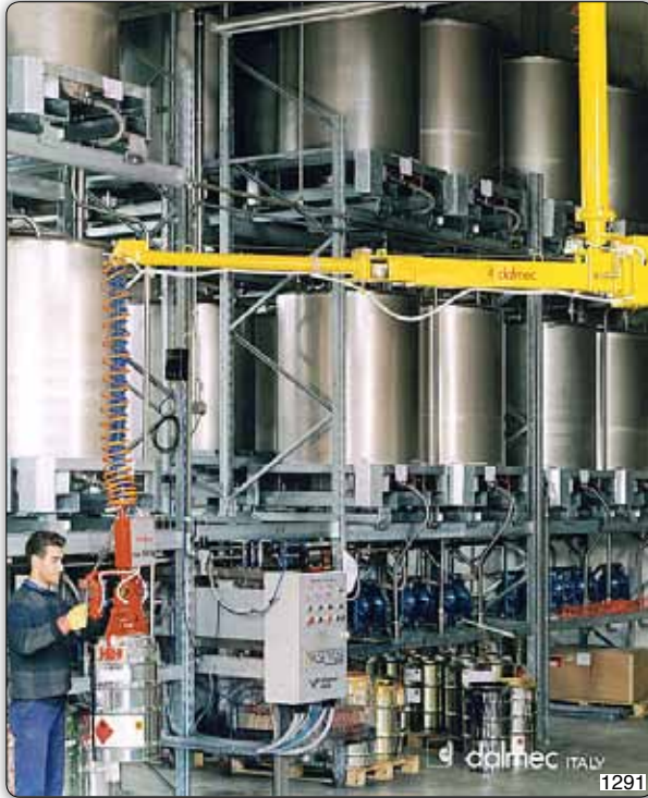
PFF type Posifil manipulator, fixed overhead version for handling metal drums.