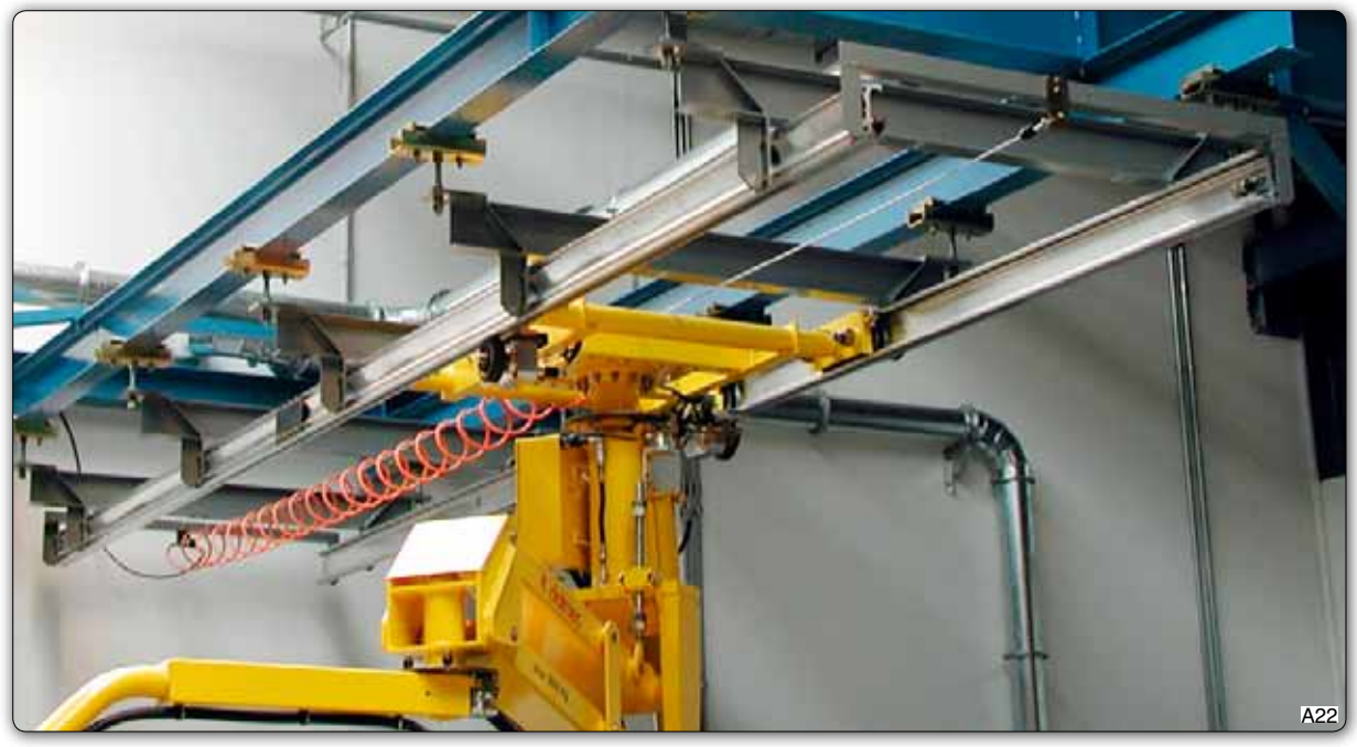
Overhead tracking system complete of end buffers and composed of two special U shaped profiles in special aluminium alloy, with steel runways and connection and stiffening ribs every 2 mt.