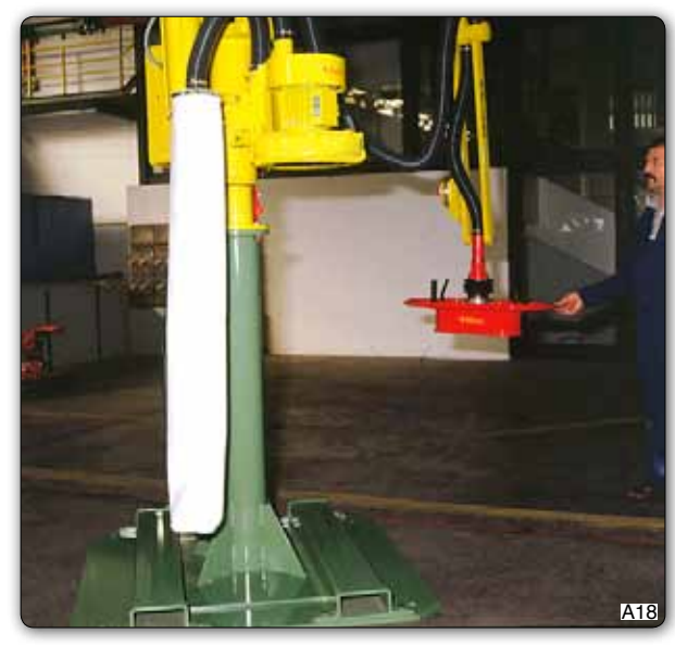
Dust recovery filter mounted on the exhaust piping of the vacuum generator.