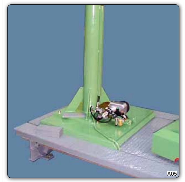
Floor built-in runway with pneumatic motor.