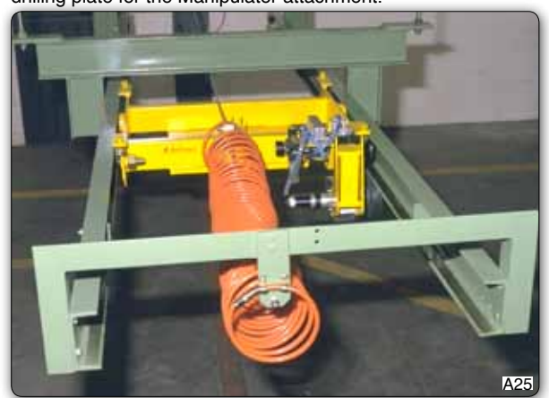
Compressed-air station to feed the Manipulator along the whole existing tracking system, composed of an air spiral, supporting cable and drive pulley.