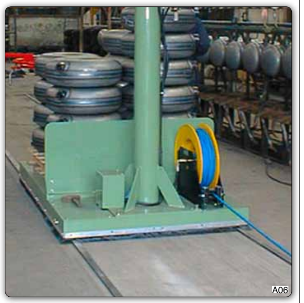
Lengthened motorized trolley running on rails to transport the products to be handled.