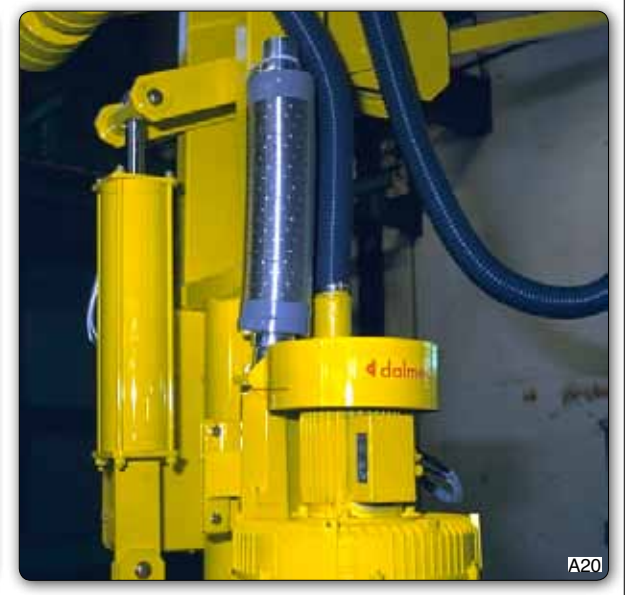
Silencer mounted on the exhaust pipe of the vacuum generator, used to reduce the noise level by 3 dB(A), from 74 to about 71.