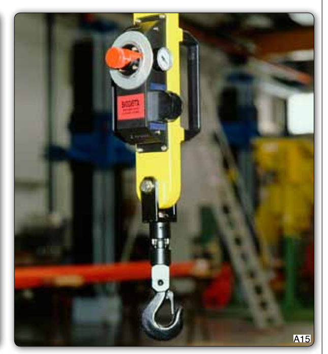
Weight pre-selector control.