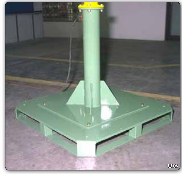
Portable baseplate for pallet truck.