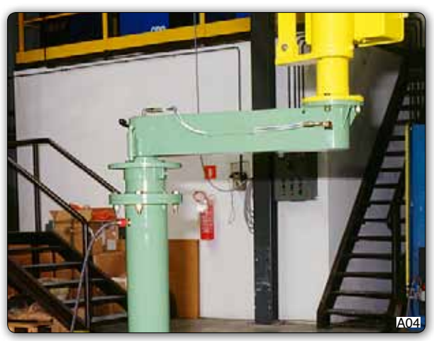
Off-set column to increase the working area of the Manipulator, complete with mechanical stop every 45^{\circ}\!.