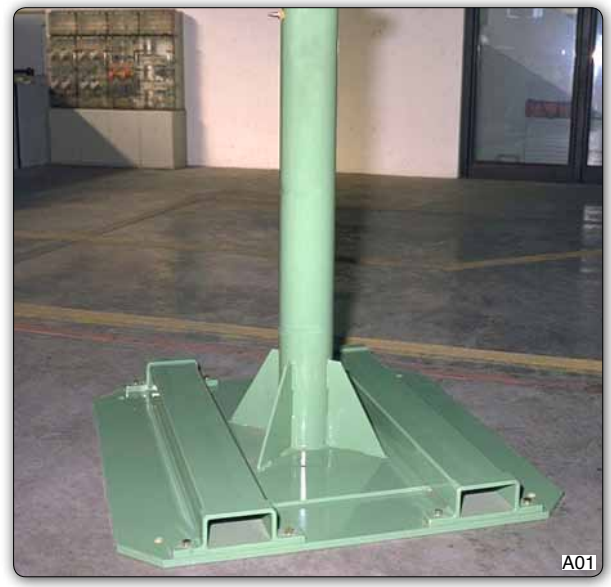
Portable baseplate for forklift truck.