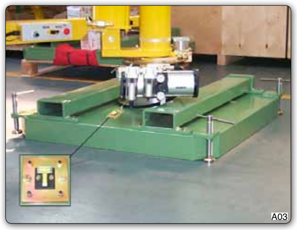
Portable baseplate with stabilizers and level.