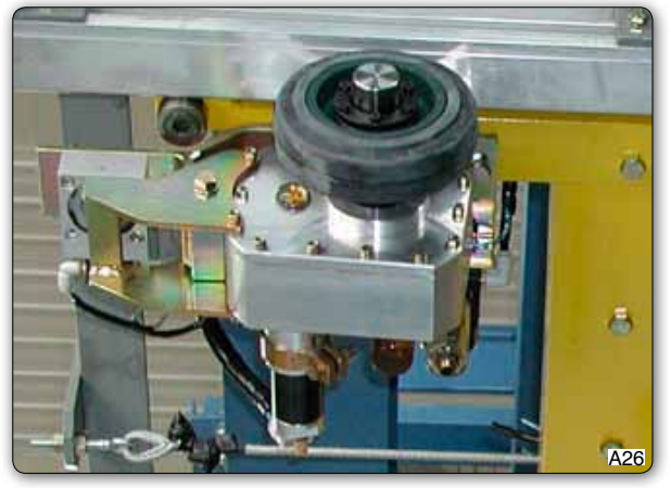
Pneumatic motorization of the translation trolley, composed of a pneumatic motor reducer unit with dragging rubber wheel, complete of filter/lubrificator, pressure regulator and push buttons controls for the back and forth running.