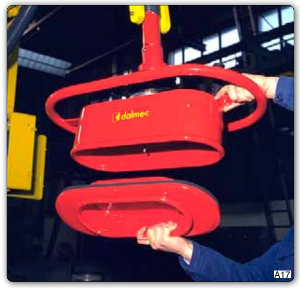
Reducer plate, easy to fasten on the tooling, for handling small bags.