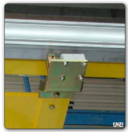
Trolley running brake.