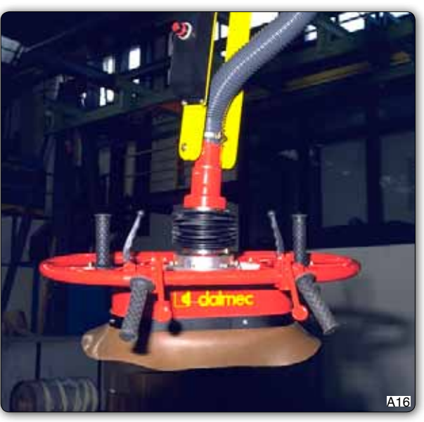
Suction cup for bags complete with rubber lip and lowered controls.