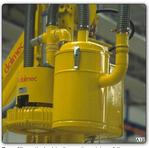
Drum filter, attached to the suction piping of the vacuum generator, used to retain the sucked dust.